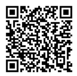
Link to this section