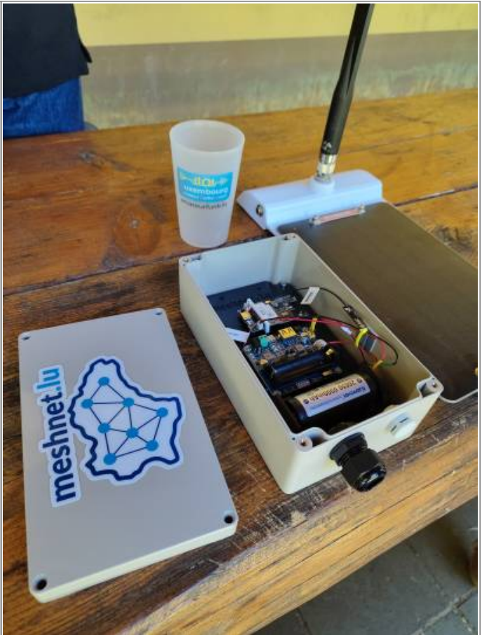
2026/06/22 12:28 · virii news , meshcore