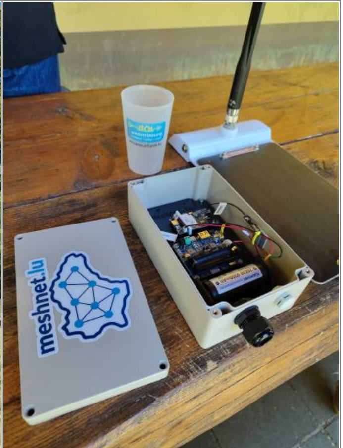
2026/06/22 12:28 · virii news , meshcore