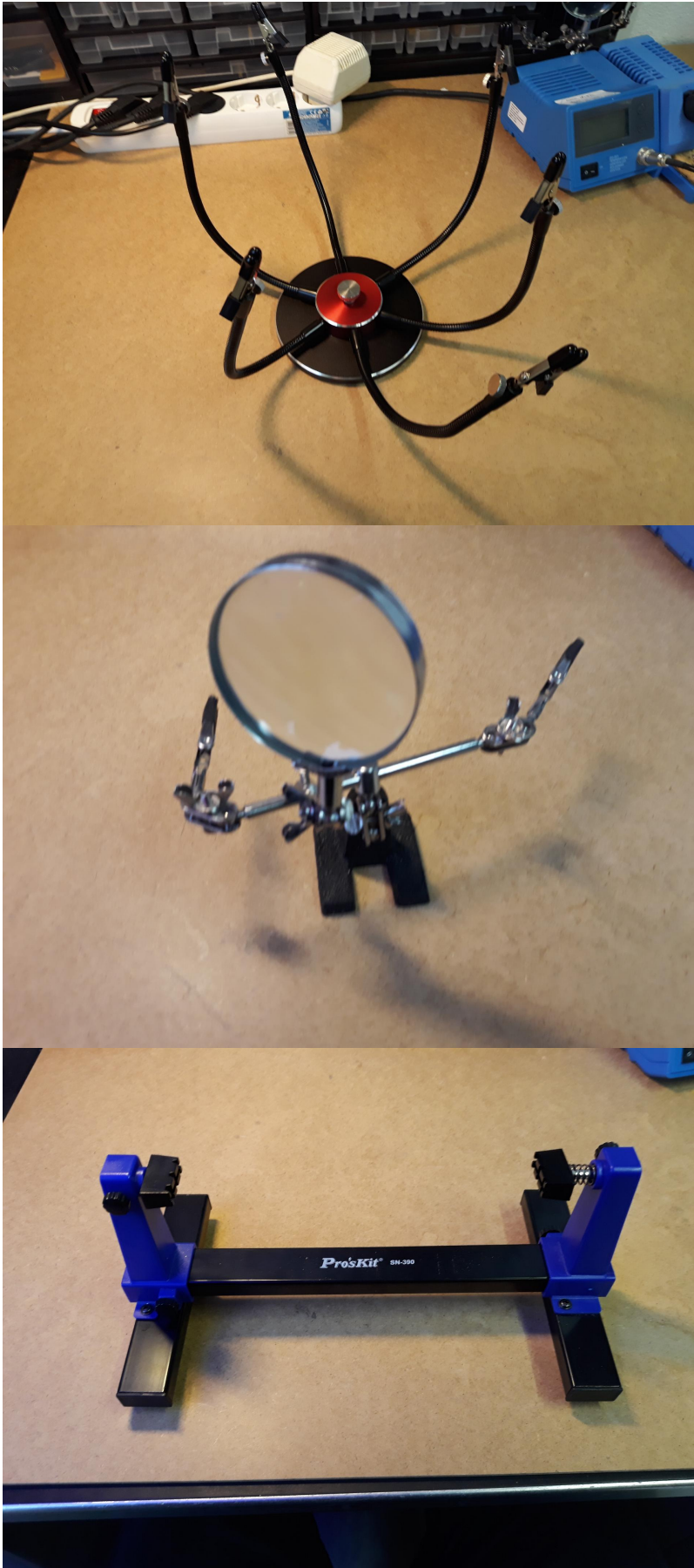
PeakTech 6225 A (DC lab power supply)