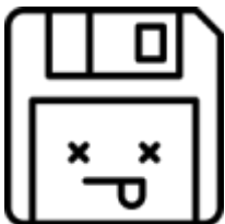
Game of Life