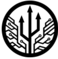
Skynetbot aka. self learning robot