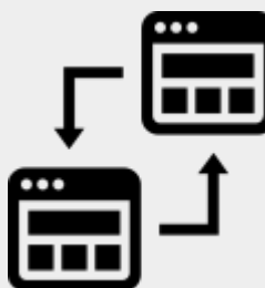
Command & Control