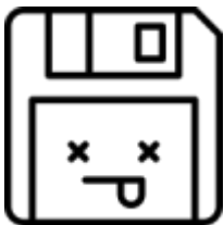
Game of Life