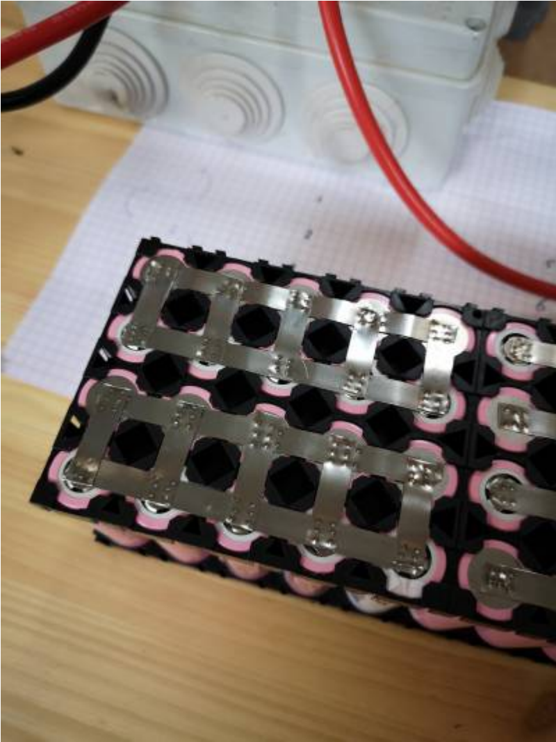
Nahaufnahme der Brücken