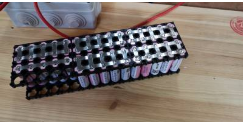
Fertiger Akku, jetzt fehlt nur noch das