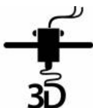
3D Molecular Construction Device aka. 3D Printing