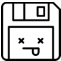
Game of Life