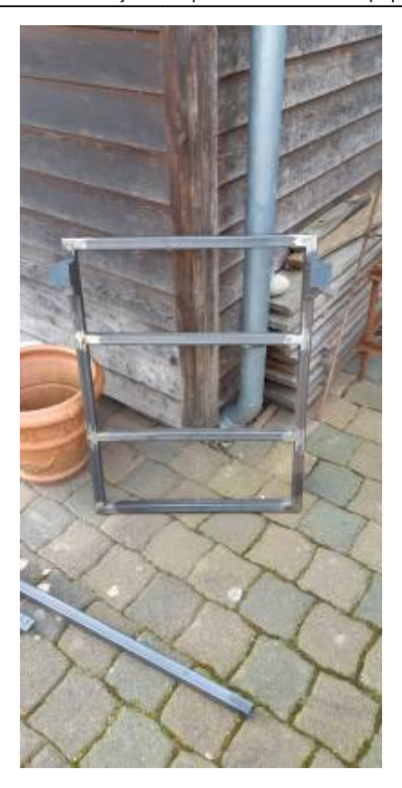
To be able to mount the front wheels and the hoverboard motors onto the chassis, we are using M8 screws. So we drill all the necessary holes into our chassis.